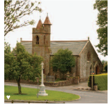
Gretna Old Parish Church