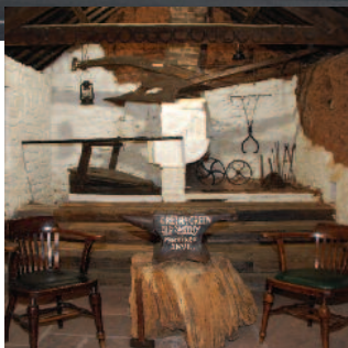
Original Marriage Room

The ancient building of the Famous Blacksmiths Shop together with Smiths creates the perfect combination of the ancient and the modern. Within this building there are three venue choices: